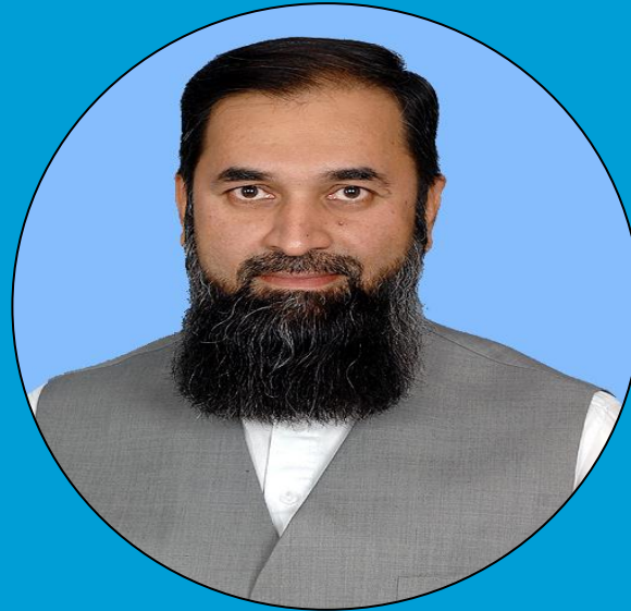
Baligh Ur Rehman Governor, Punjab Chancellor