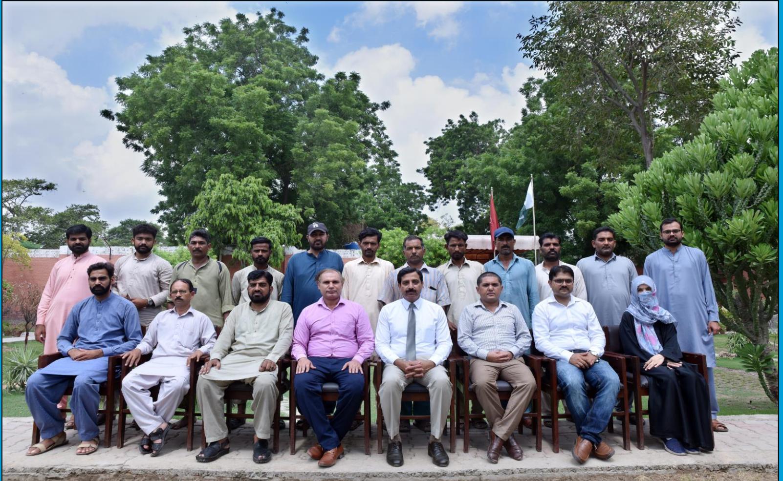
Group Photo of Non-Teaching Faculty with Principal